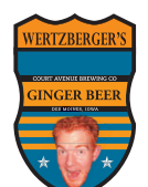
Wertzberger's Ginger Beer (NA)